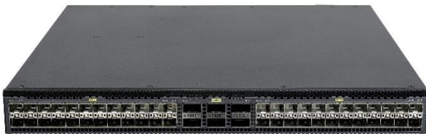
S6825-54HF front panel