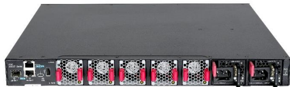
S6825-54HF rear panel