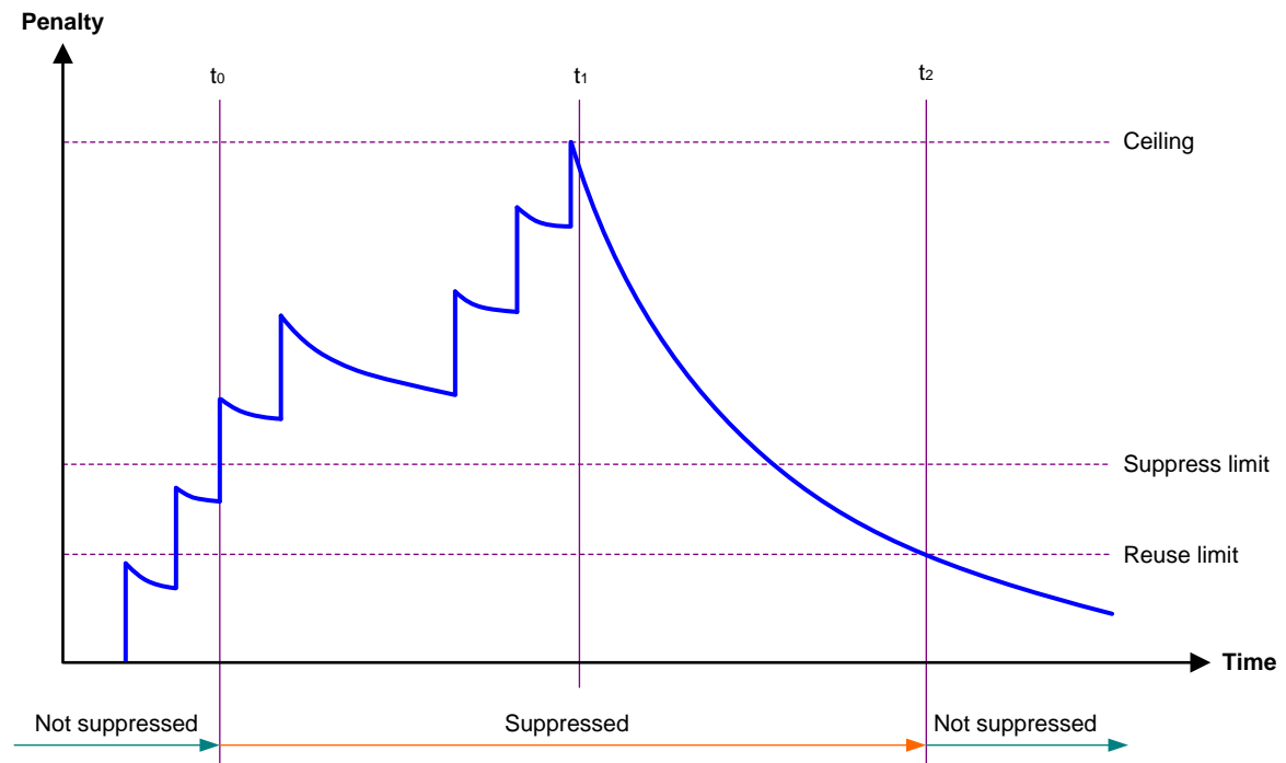
Figure 1 Change rule of the penalty value

Figure 1 shows the change rule of the penalty value. The lines t_0 and t_2 indicate the start time and end time of the suppression, respectively. The period from t_0 to t_2 indicates the suppression period, t_0 to t_1 indicates the max-suppress-time, and t_1 to t_2 indicates the complete decay period.